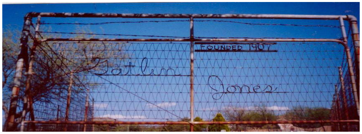
See burial list here → Gatlin Jones Cemetery, Patagonia, Santa Cruz County, Arizona

Donations to the Last Alarm Foundation at <a href="http://lastalarmfoundation.com/">http://lastalarmfoundation.com/</a> or the Alzheimer's Association at <a href="http://alz.org/">http://alz.org/</a> are welcomed by the family.